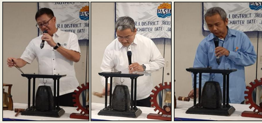
Pres. Dodie and Zone 6 presidents call the zone meeting to order.