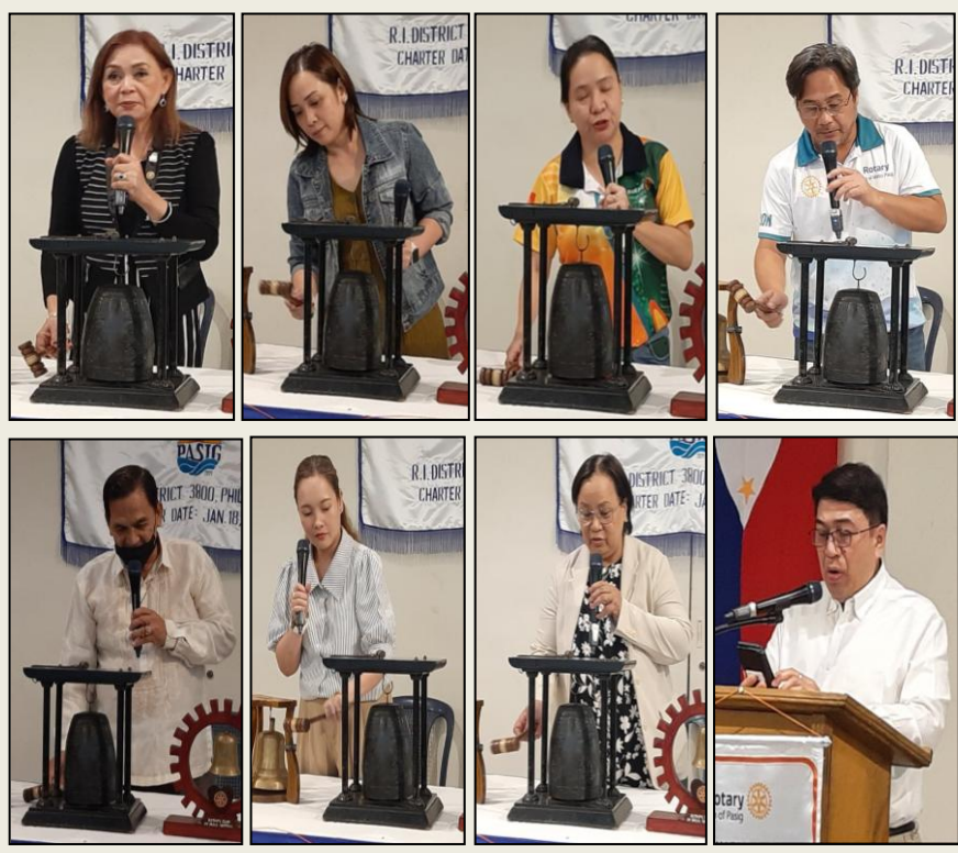
PP Bong emcees the meeting.