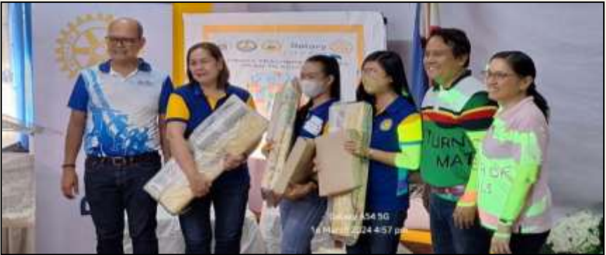
Handover of teaching aids.