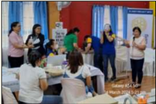
A message from Rtn Mayor Vico. Awarding of certificates begins.