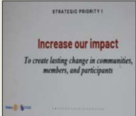
Statement, TRF Mission and Strategic Priorities of Increasing Impact;