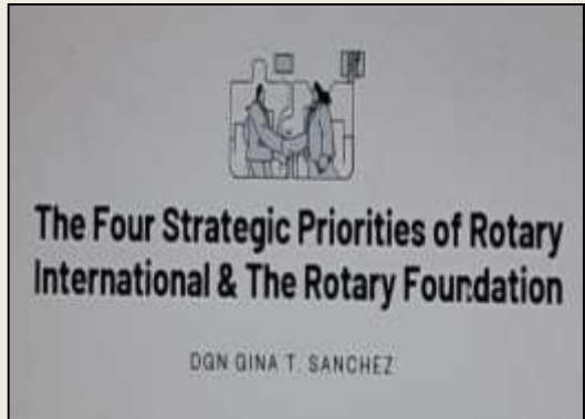
DGN Gina talks on The Four Strategic Priorities of Rotary International