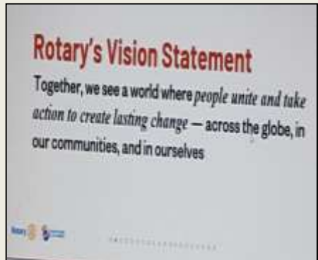
& The Rotary Foundation. Her talk covers Rotary's Vision 21.