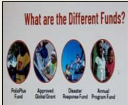
Engagement & Increasing Ability to Adapt.