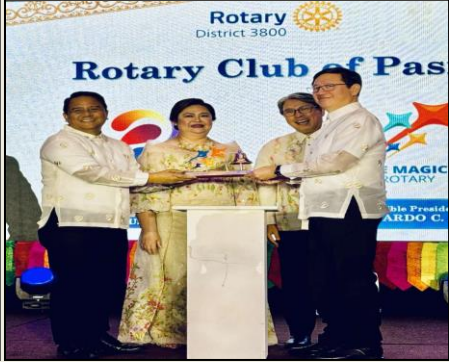
Turnover from the Hope Creating President to the Irresistible President.