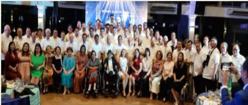
With the spouses led by spouse Alu.