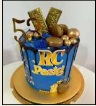
Celebration at Valle Verde 6 Clubhouse. 53rd Charter Anniversary cake.