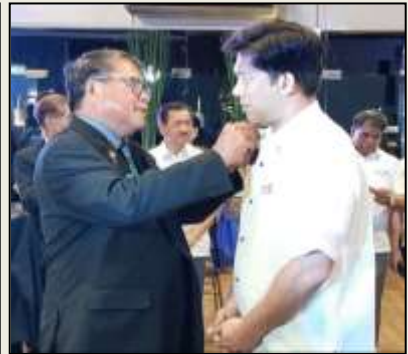
Sponsor PP Ramy pins Rotary pin. DG Pope pins D3800 pin.