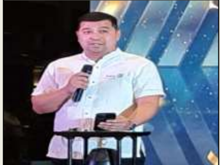
PE Dodie on PNP Awards. PND Tet on hand washing & drinking station.