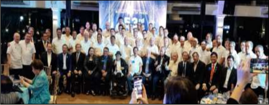
And with DG Pope Solis & PDGs.