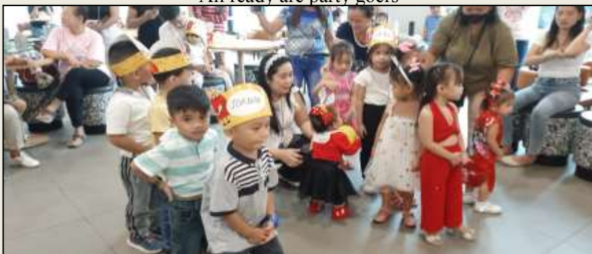
The fun games begin.