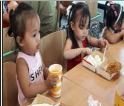
It's time to enjoy chicken McDo.