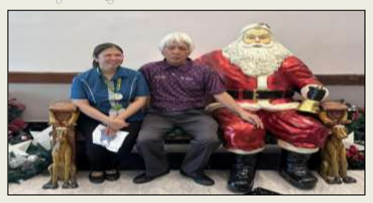
RCP's Santa Claus Rtn Flor gifting 108 patients with P1,000 each.