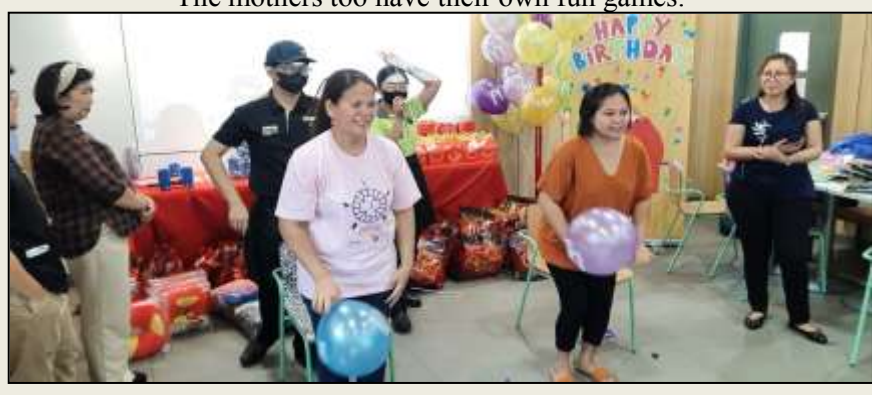
A balloon bursting contest.

The mothers too have their own fun games.