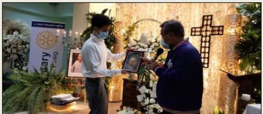
HCP Adolf hands over Tinig photo of PP Esto to grandson.