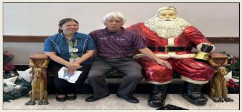
RCP's Santa Claus Rtn Flor gifting 108 patients with P1,000 each.