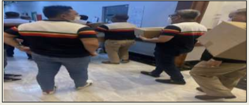
Getting ready to distribute the Christmas gifts.