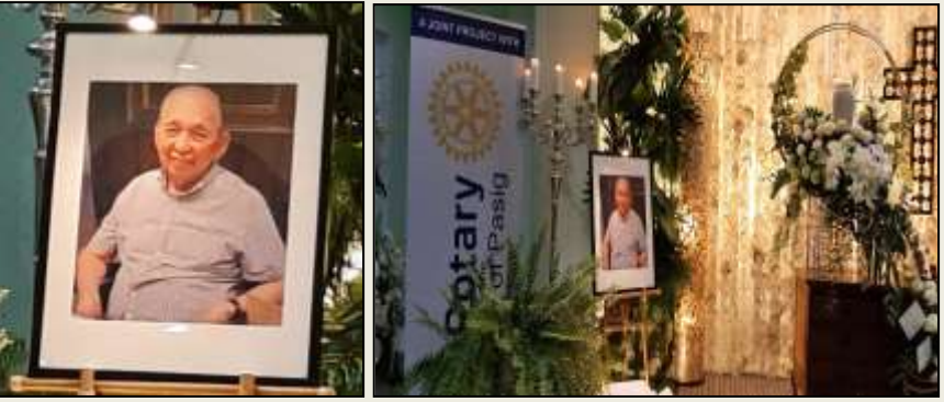
CM/PP Esto's photo and urn.