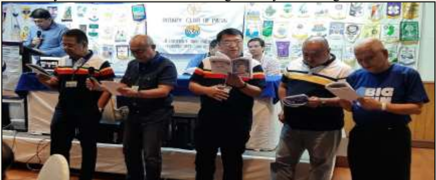
Pangkat 1 sextet singing 15.

IPP Bong leads singing of Pambansang Awit. The Four Way Test is recited by Rtn Roehl. Introduction of guests by IPP Bong.