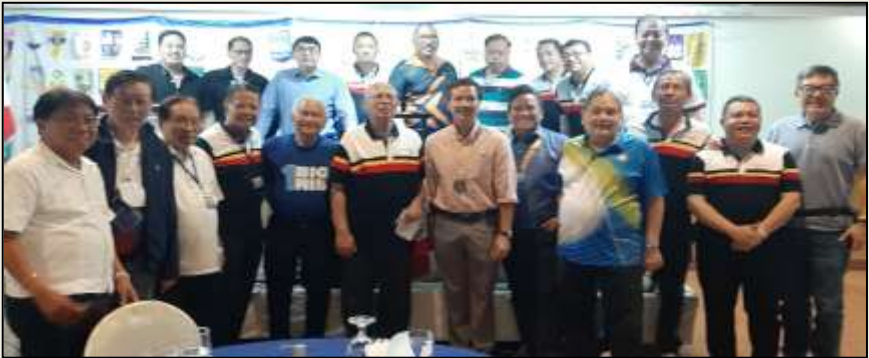
A photo with the Noble Men.