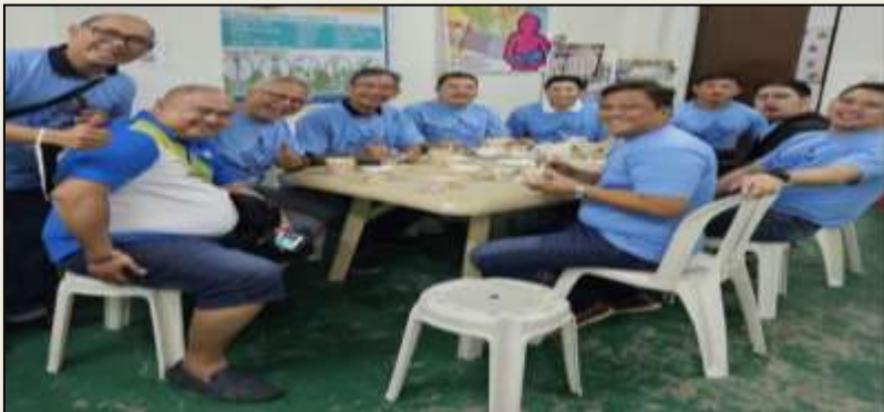
Enjoying arroz caldo & tokwa't baboy after a busy Sunday morning.