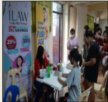
Waiting mothers. Screening time.