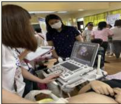
Doing a prenatal ultrasound.