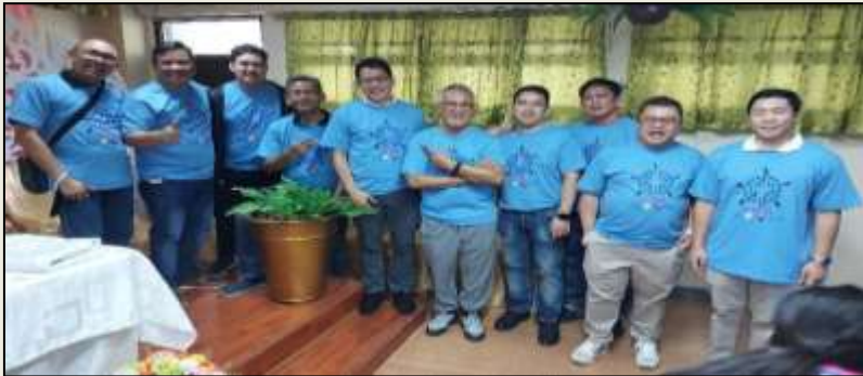
Nine Sunday do-gooders & a prospective member.