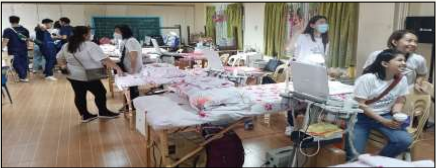
TMC facilities & team all ready.