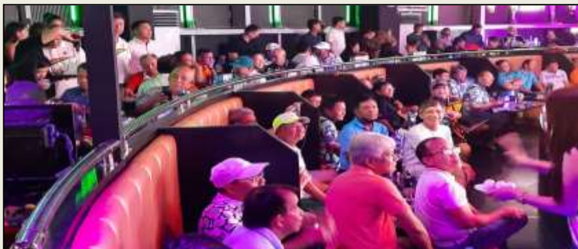
An afternoon of food, fun & fellowship for D3800 golfers!