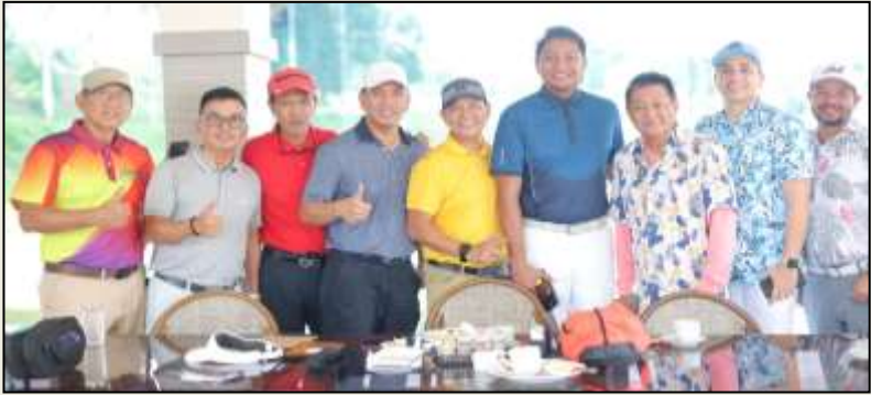
Some D3800 Rotarian golfers.