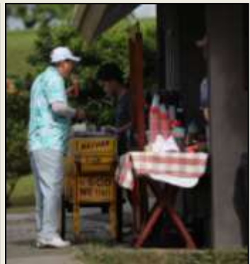
After a missed putt, an ice cream to refresh and energize.