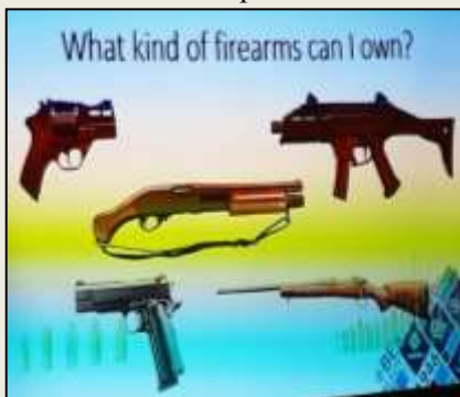
with focus on how to own firearms,