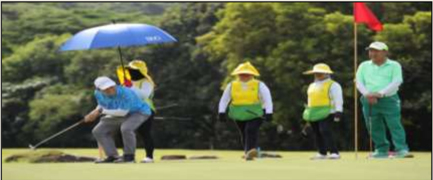
Ay naku...I missed it!