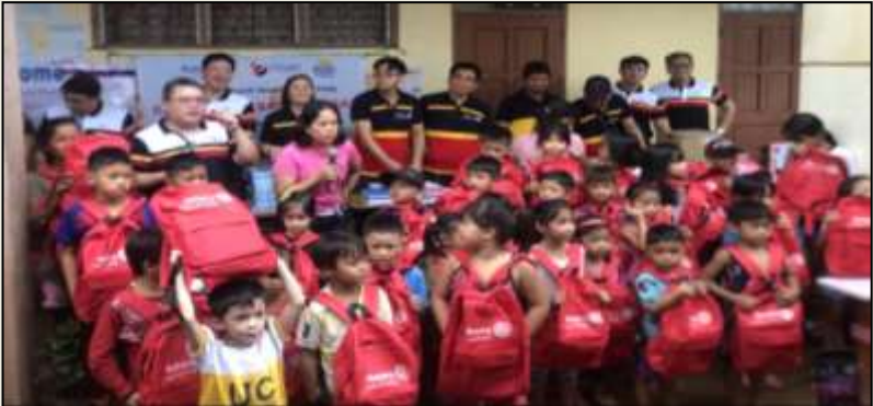
The Batang Baras with their filled up bags.