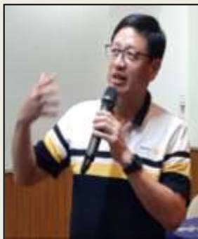
Replying to questions from PP Ferd and PE Dodie.