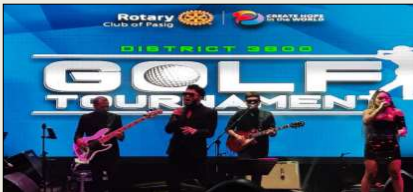
Entertainment number from Bar's IX Sideways.