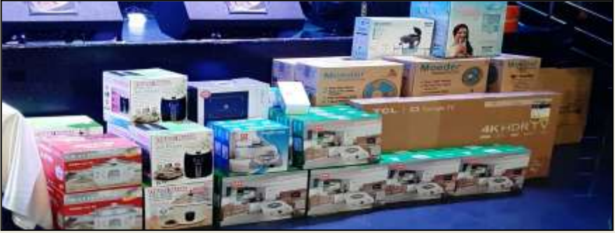
Some of the many raffle prizes.