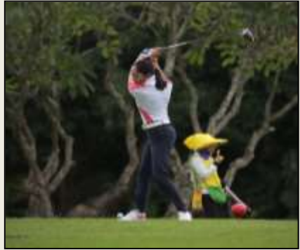
Eyes on the ball!