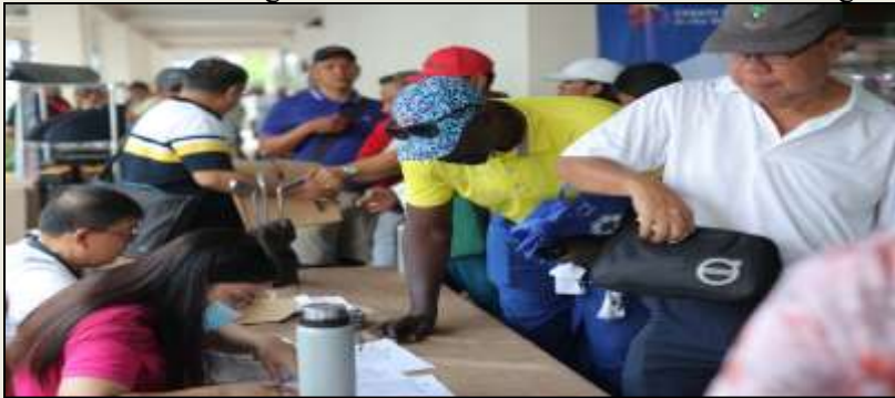
It's registration time.