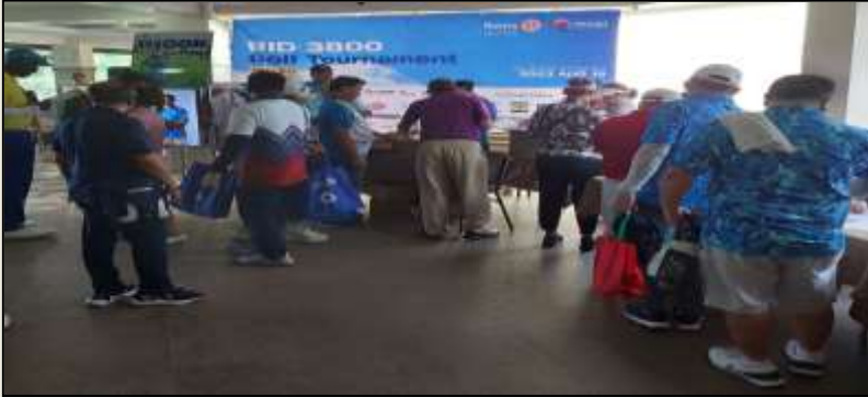
Club hosts 1st Leg of D8000 Golf Tournament at Hallow Ridge.