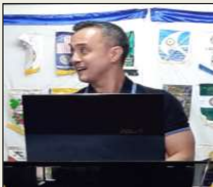
He talks on Responsible Gun Ownership