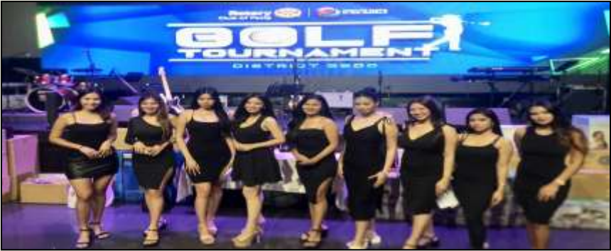
Golf Tournament Awarding & Fellowship at Bar IX in Alabang.