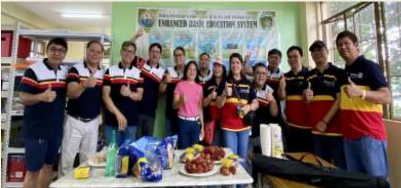
The 8 Noblemen with the school principal & RC Baras Rotarians.