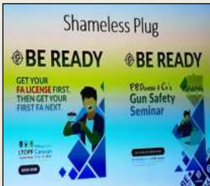
the kinds of firearms one can own and firearms safety.