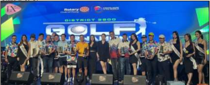
Tournament winners with Bar IX models.