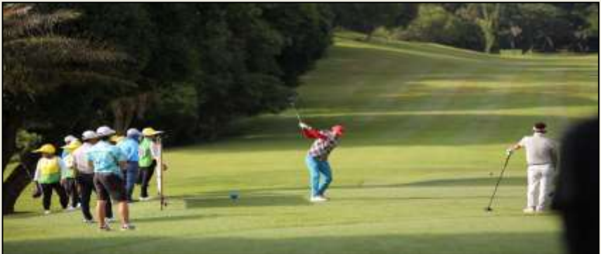
It's tee off time!