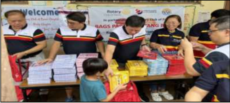
PP Jun, IPP Bong & PE Dodie are at it too.