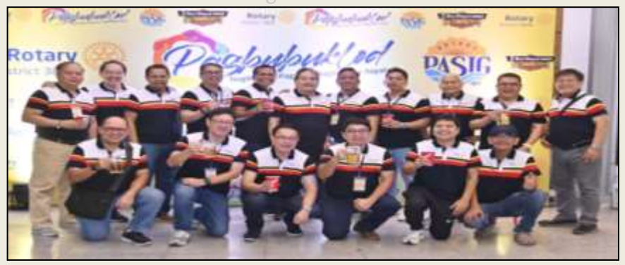
The earlybirds...for the beer!