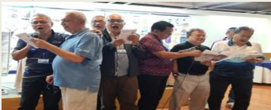
Pangkat 3 singing "Love" by John Lennon.