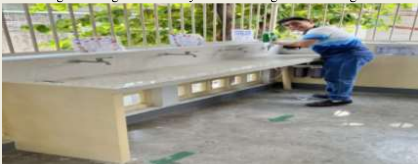
at Ilugin Elementary School in Bgy Pinagbuhatan