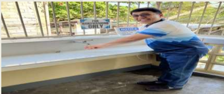
IATP Bong checking on the newly built drinking. and washing stations