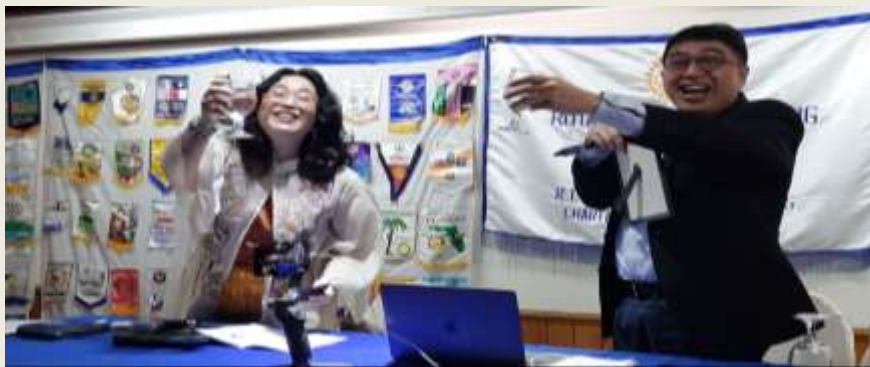
IATP Bong offers a toast!