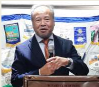
Explaining to PPE Garrick ICC's strong judicial ethics.