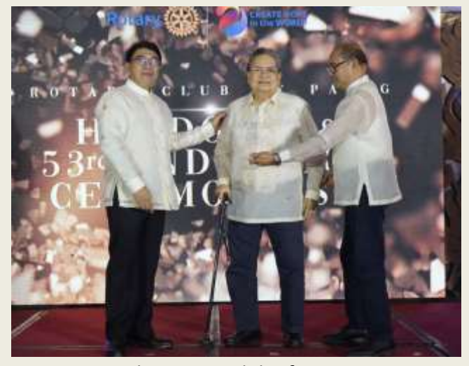
The Rotary Club of Pasig presents this Distinguished Service Award to