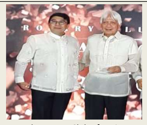
The Rotary Club of Pasig presents this Presidential Citation Award to