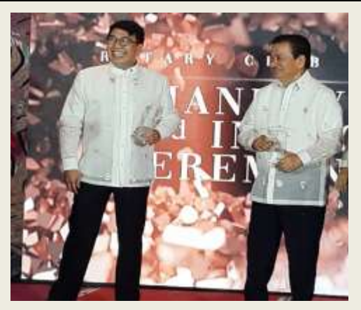
The Rotary Club of Pasig presents this Presidential Citation Award to