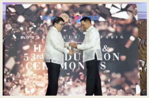
The Rotary Club of Pasig presents this Distinguished Service Award