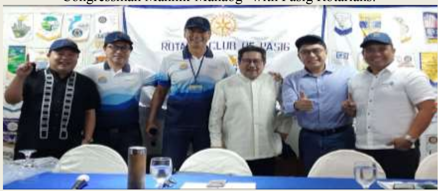
Donning golf tournament caps.