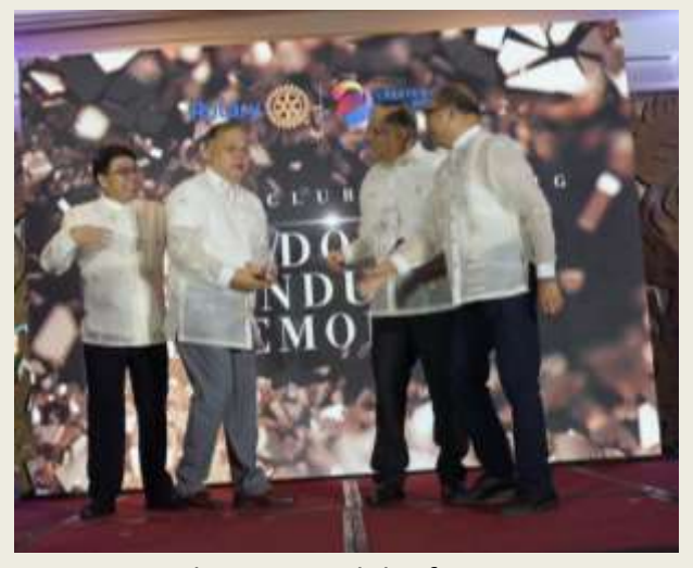
The Rotary Club of Pasig presents this Distinguished Service Award to