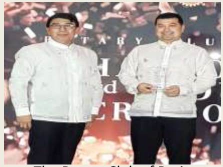
The Rotary Club of Pasig presents this New Rotarian of the Year Award to