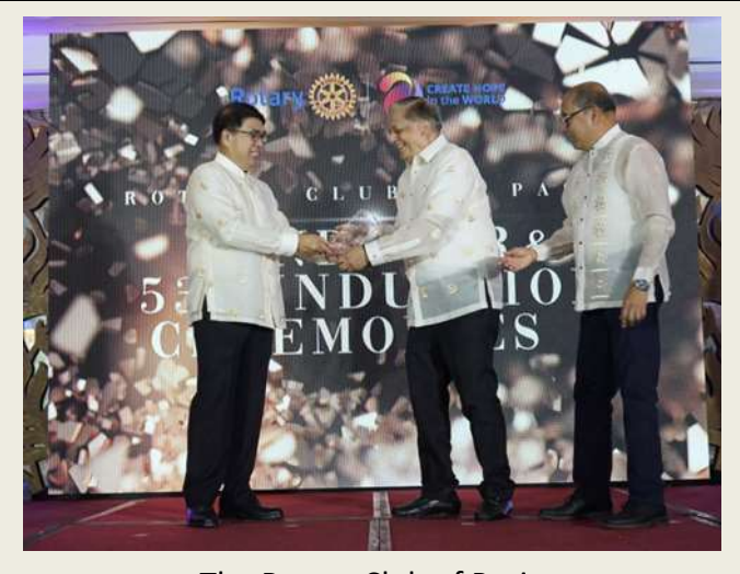
The Rotary Club of Pasig presents this Distinguished Service Award to