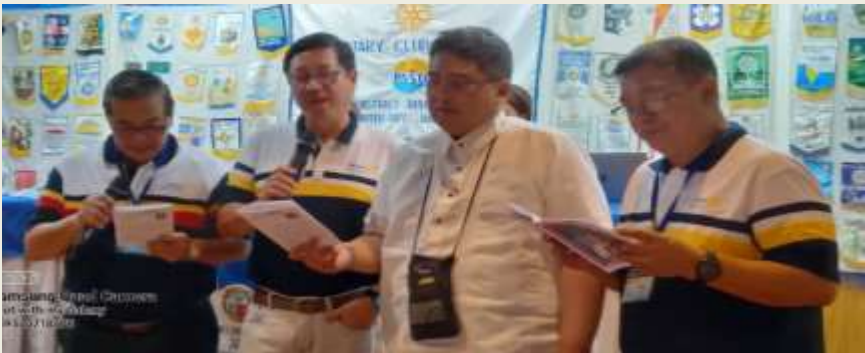
Pangkat 2 quartet singing "My Rotary Day".