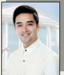
VICTOR MA. REGIS “V. BLA SOTTO Mayor, Pasig City

Vico Sotto finished his bachelor's degree in political science, and his master's in management in 2018, with honors, both at the Ateneo de Manila University.