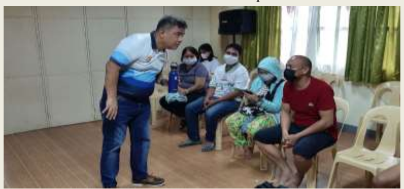
HCP Adolf is all ears on a waiting patient.