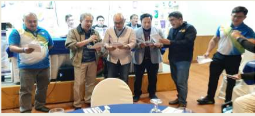
"Kahit Na Maputi Ang Buhok Ko" is sung by Pangkat 1 sextet.