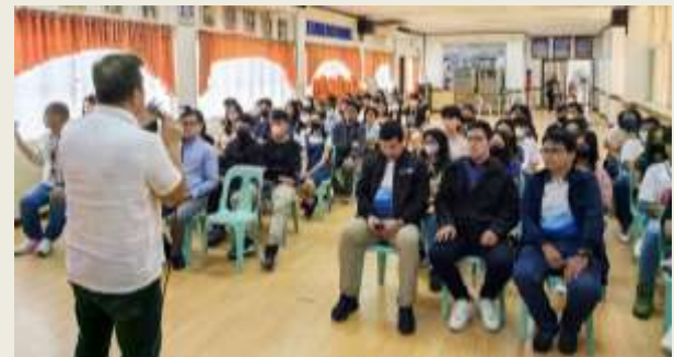
Inspirational message by HCP Adolf to RHS scholars.