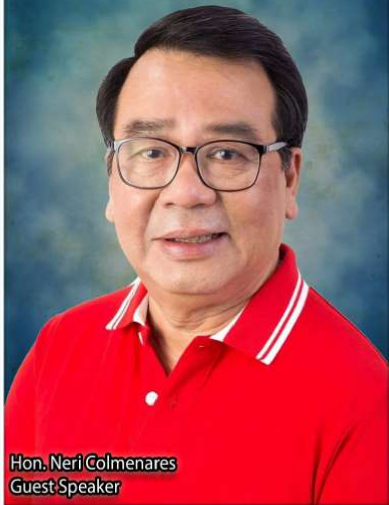
Hon. Neri Colmenares Guest Speaker

The Official Newsletter of the Rotary Club of Pasig