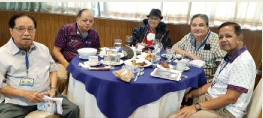
Club's oldies are happy together too!