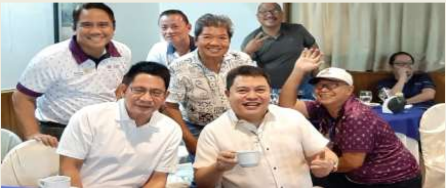
Pasig Rotarians... happy together!