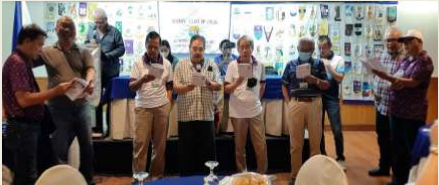
Group singing Now We're Together, a lyrics adaptation of Getting To Know You.