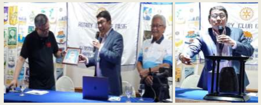
IATP Bong hands over token of appreciation then adjourns meeting.