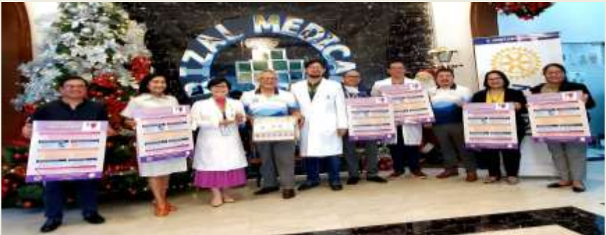
Preeclampsia Awareness Posters & "Saving 2Lives Matter" patients' brochures to RMC Preeclampsia Clinic Team.