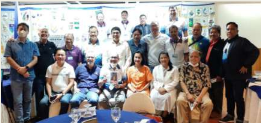
and with f2f attendees.