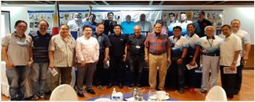
A group photo with speaker and guests.