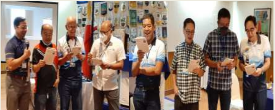
Pangkat 6 octet sings Never On My Rotary Day