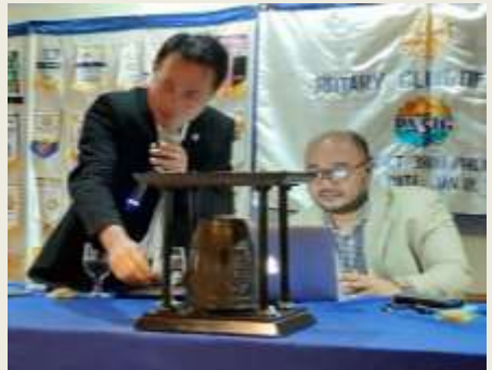
A handshake followed by adjournment.