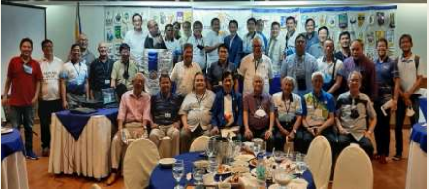
Group photo of f2f attendees.