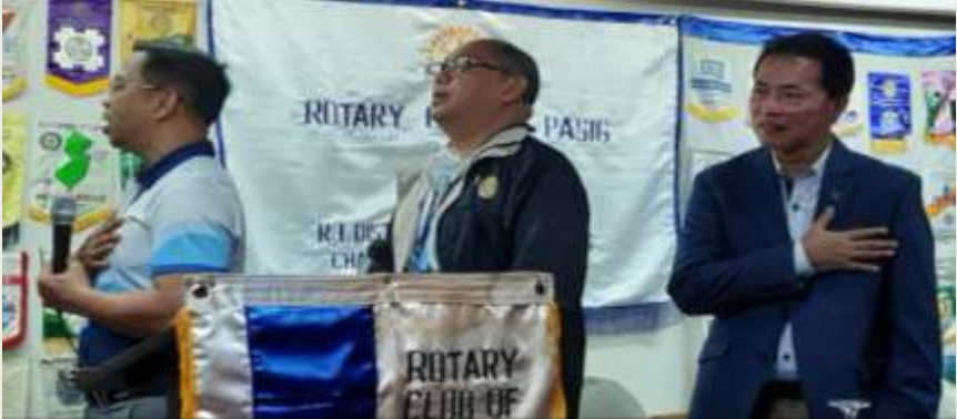
The Pambansang Awit is sung.