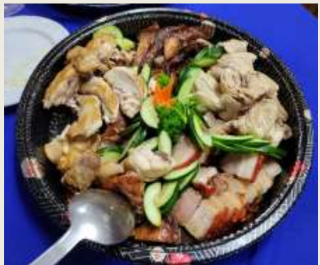
chicken inasal from Rtn Phillip and roast duck & cold cuts from Rtn Bernard.