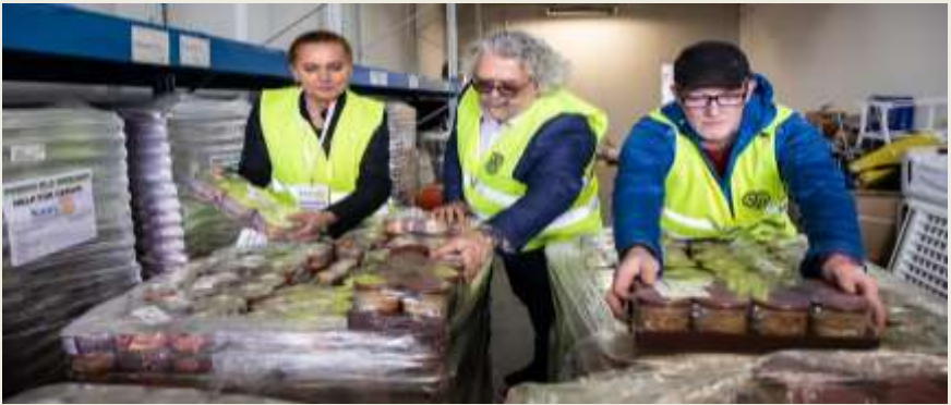
Rotary members and other volunteers pack donated supplies at a rented warehouse in Zamosc, Poland, a major hub for refugees and a centralized coordination location for aid from clubs in Europe.

The Rotary Foundation has raised more than $15 million in contributions that are already helping provide people in Ukraine with essential items such as water, food, shelter, medicine, and clothing. Donations made to the Disaster Response Fund after 30 April will be available to all communities around the world that need assistance recovering from disasters.