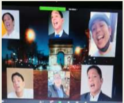
Pangkat 1 sings Fly Me To The Moon