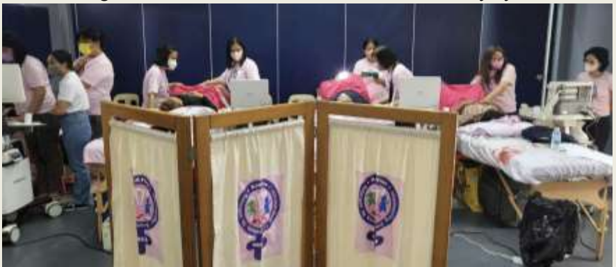
Where the action is!