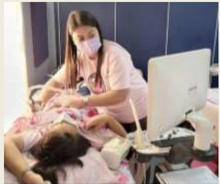
Doing a breast examination. Prenatal ultrasound being done.