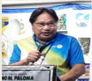
who also leads singing of Pambansang Awit after the invocation.