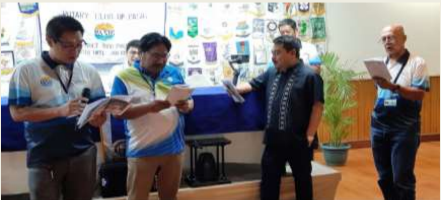
"That's What Friends Are For" is sung by Pangkat 5 quintet.