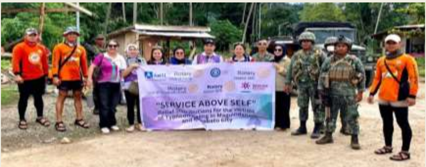
RC Pasig is one of 6 donors.