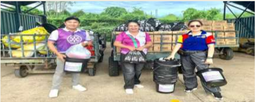
RC Cotabato East Rotarians with relief goods.

Distribution of relief goods to Typhoon Paeng victims in Pura, Datu Blah Sinsuat, Cotabato.