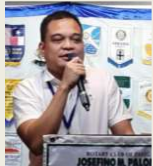
up to his current lighting industry involvement. Replying to questions from...