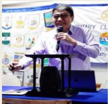
IATP Bong hands over club's token and then adjourns meeting.