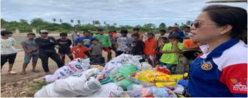
Pura typhoon victims await distribution.