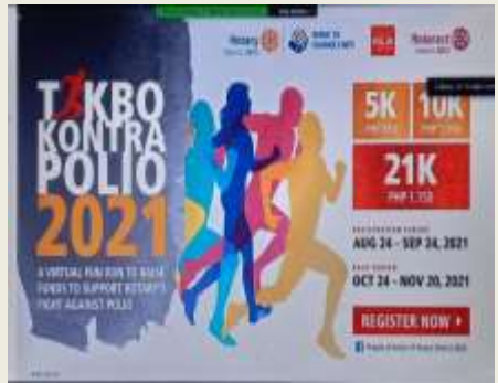
LCP _____ of RC _____ announcing Takbo Kontra Polio 2021