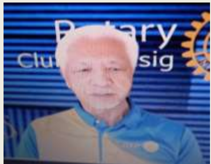
Finance Committee report by IPP Rj General Assembly adjournment by PP Topax