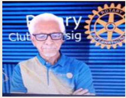
It's LCP Garrick's time LRMFCC Chair PP Topax starts General Assembly