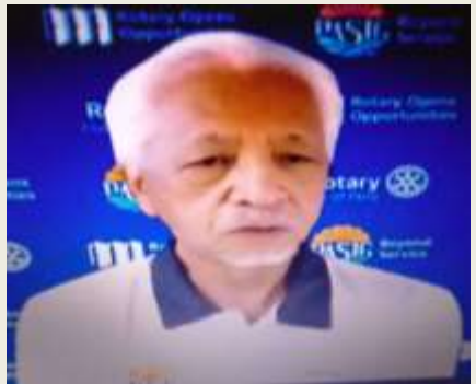
Rtn Dodie on fraud here PP Topax on on-line business security system