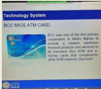
His topic is Best Practices in Credit Cooperative.