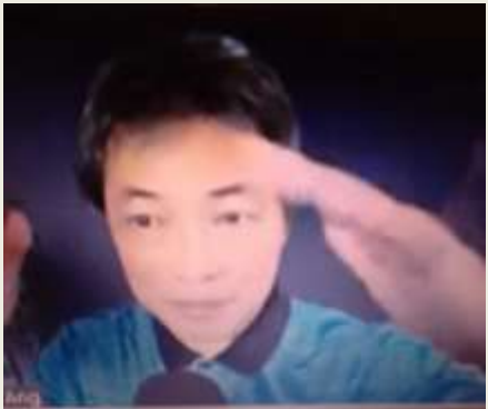
PP Henry on increasing shares; LCP Garrick on online transactions &