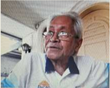
Replying to questions from PP Bert on unpaid loads during pandemic;